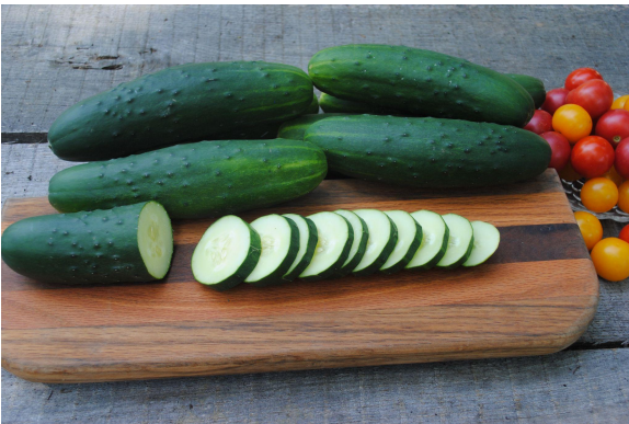
Cucumber, DMR 401 (Slicer)