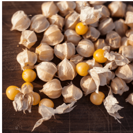
Ground Cherry, Cossack Pineapple