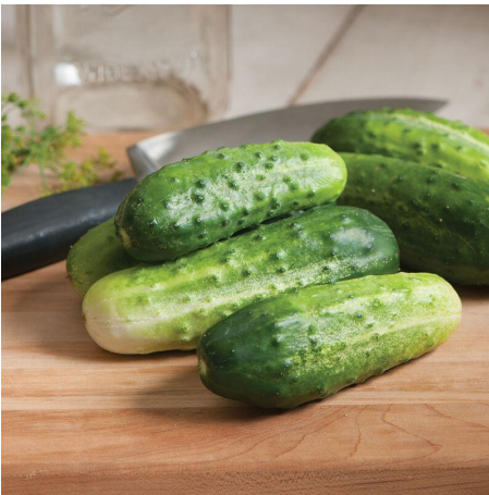
Cucumber, Little Leaf (Pickler)