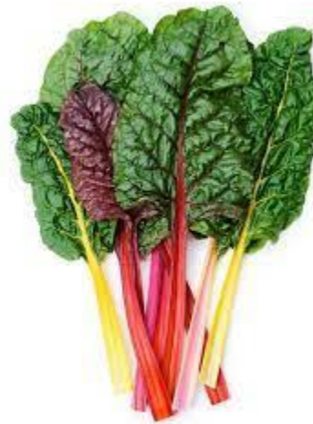
Chard, Bright Lights