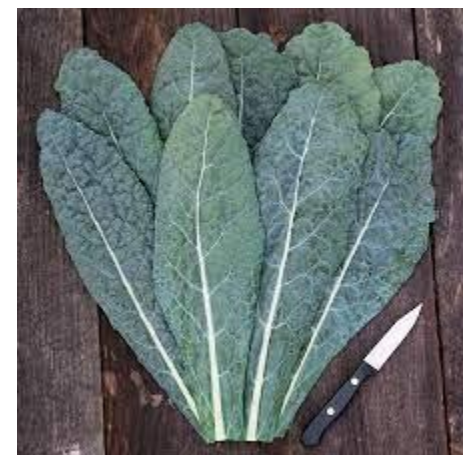
Kale, Red Russian / Lacinato