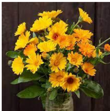
Calendula, Yellow/Orange Resina

Beautiful purple stems and blooms. Flavorful garnish with an anise/clove type flavor.