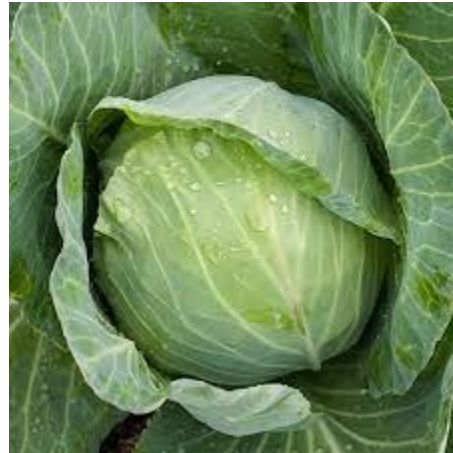
Cabbage, Golden Acre