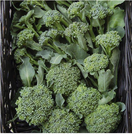
Broccoli, De Cicco