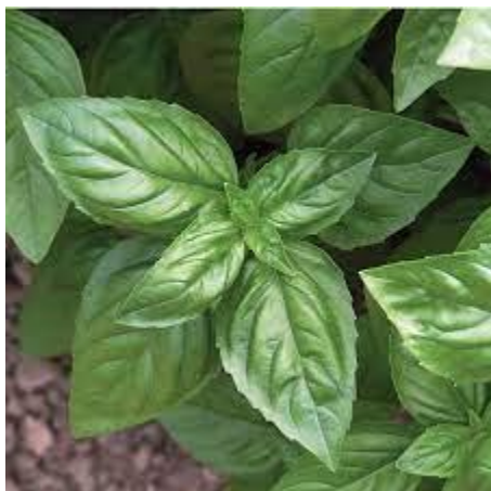
Basil, Sweet Genovese