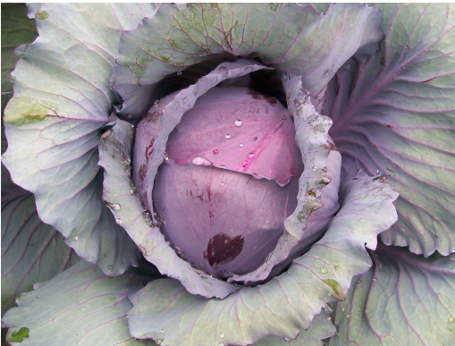
Cabbage, Red Acre

After harvesting the central head, these plants will produce abundant side shots throughout the season.