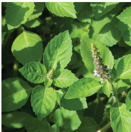
Basil, Holy (aka Tulsi)